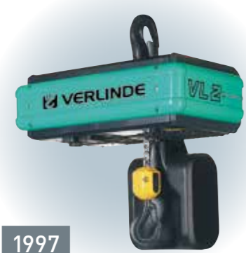
1997 Eurochain VL