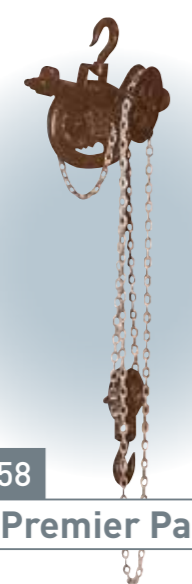
1858 Premier Palan