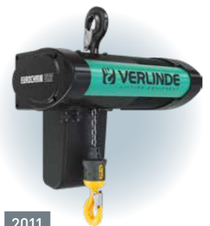
2011 Eurochain VR