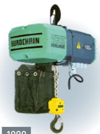
1989 Eurochain VE