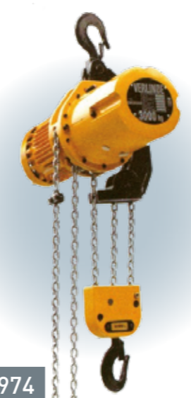
1974 Eurochain 2